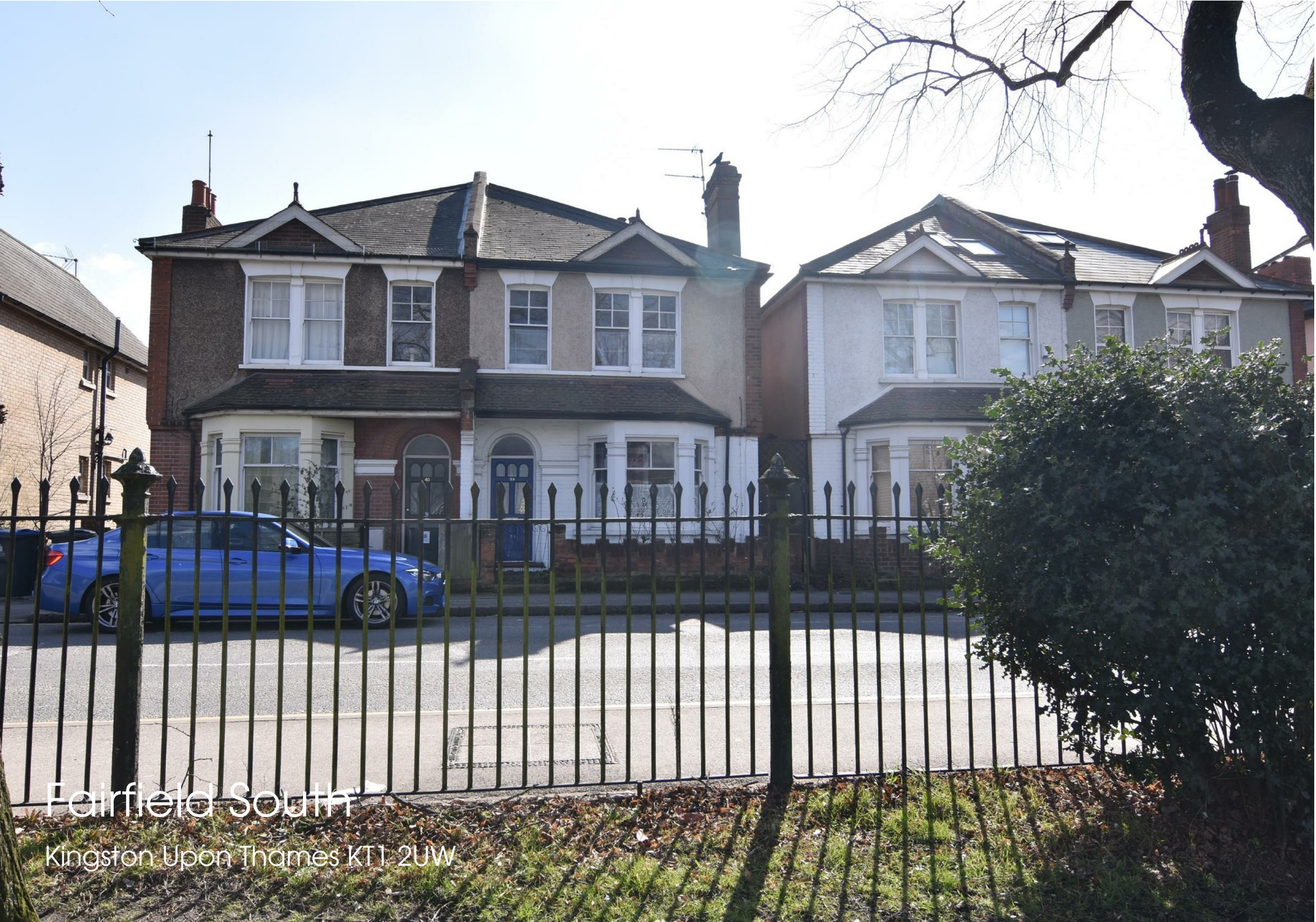
Fairfield South Kingston Upon Thames KT1 2UW